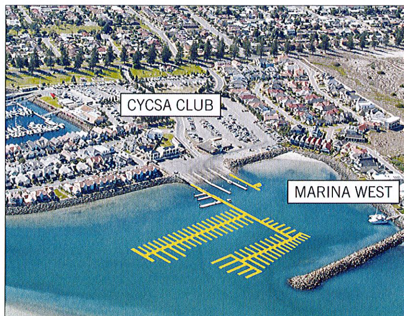
Consideration for both members of the Cruising Yacht Club of SA Inc. and the general boating public has produced a marina design which will see Marina West guarantee maximum amenity and accessibility for both parties for decades to come...

"We're finding people are wanting to upgrade their boats but have nowhere suitable to store them on the water, so a