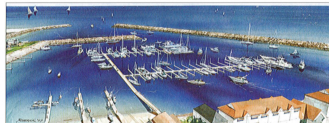
This artist's impression of Marina West shows clearly how the existing amenity of our busiest public boat ramp will continue unabated with the realisation of the prestigious new berthing facility, late in 2008 ...

This new walkway will also have a finger attached, dedicated for use by emergency services.